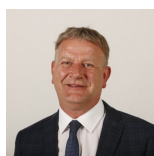
David Torrance Scottish National Party