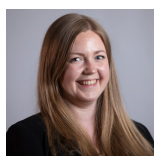
Gillian Mackay Scottish Green Party