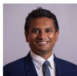
Sandesh Gulhane Scottish Conservative and Unionist Party