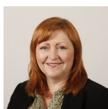
Emma Harper Scottish National Party