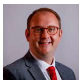
Deputy Convener Paul O'Kane Scottish Labour